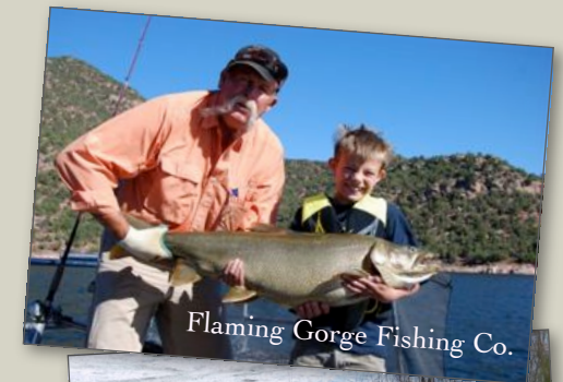
Flaming Gorge Fishing Co.